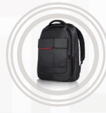
ThinkPad Professional Backpack