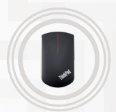
ThinkPad Precision Wireless Mouse