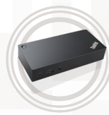
ThinkPad Thunderbolt 3 Dock